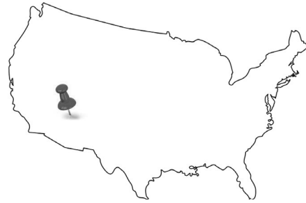
The Grand Canyon